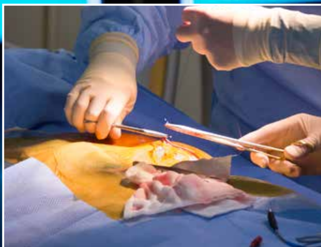
DEFIB PROCEDURE IN ACTION