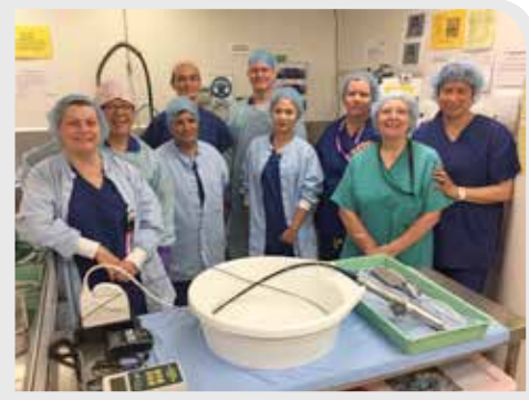
The team with the new equipment

One of our major donors recently gave us the funds to buy a Transoesophaegal Echocardiograph Probe Testing Kit. Transesophageal echocardiography (TEE) is a test that takes pictures of your heart. TEE uses high-